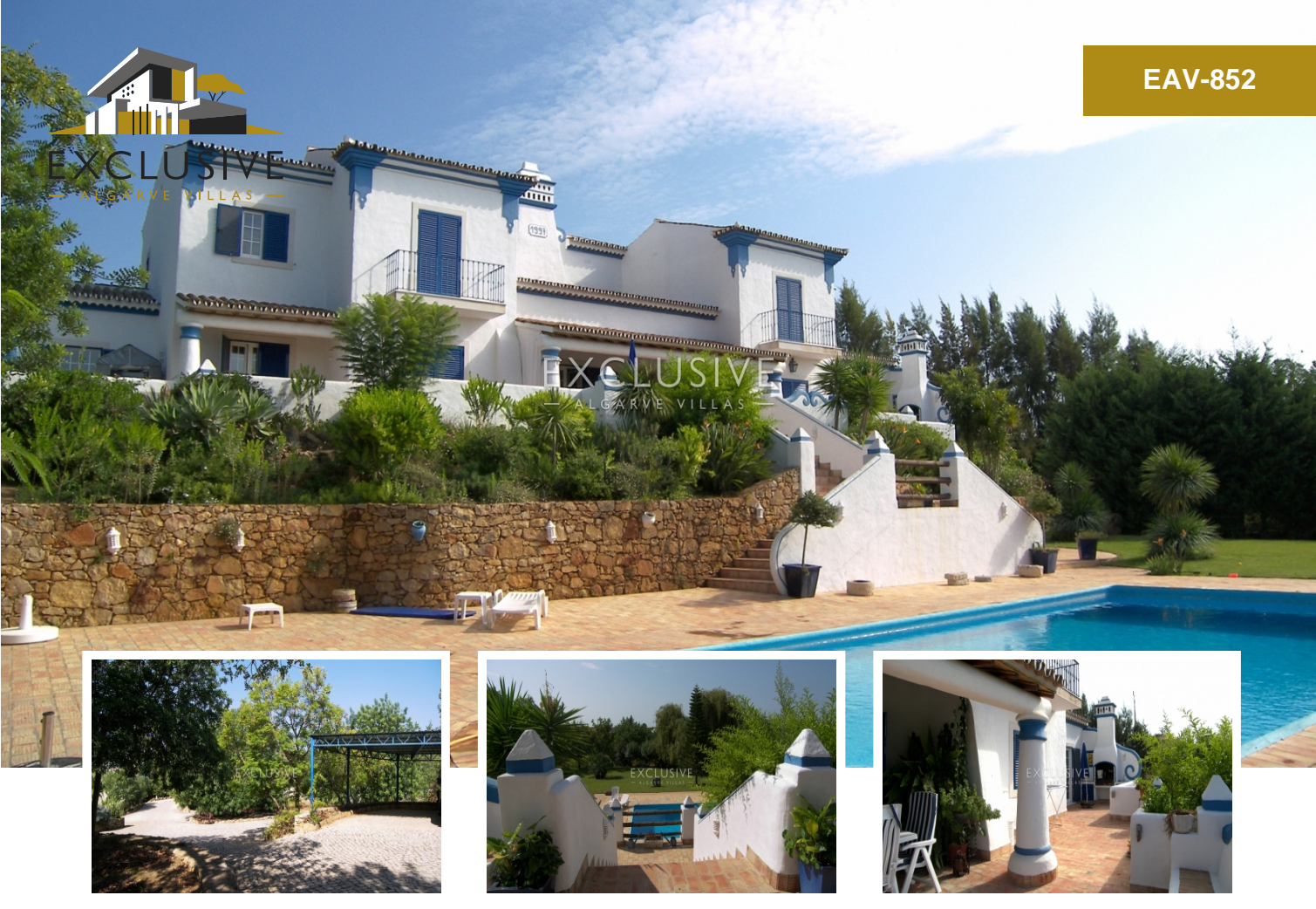
VIVENDA COM 3 HA. DE TERRENO DE ESTILO TRADICIONAL PARA VENDA ALMANCIL LOULE