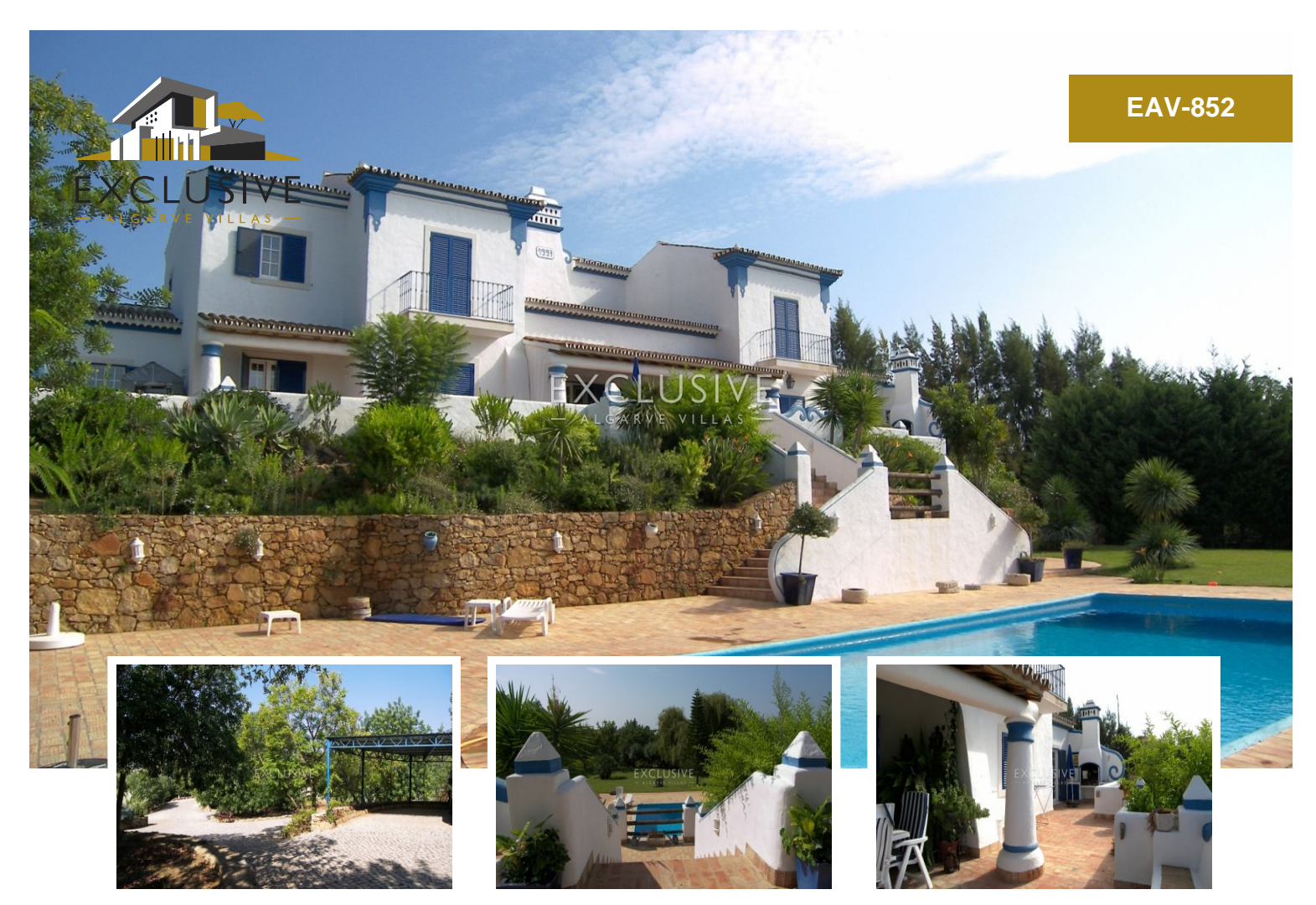
TRADITIONAL QUINTA STYLE MANSION FOR SALE WITH 3 HA. OF LAND FOR SALE IN ALMANCIL CENTRAL ALGARVE