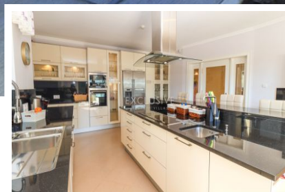
4 BEDROOM VILLA, 300 M FROM THE BEACH, ALBUFEIRA