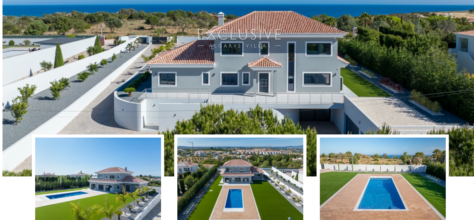
LARGE AND MODERN, PRIVATE VILLA WITH SEA VIEWS, FOR SALE IN LAGOS