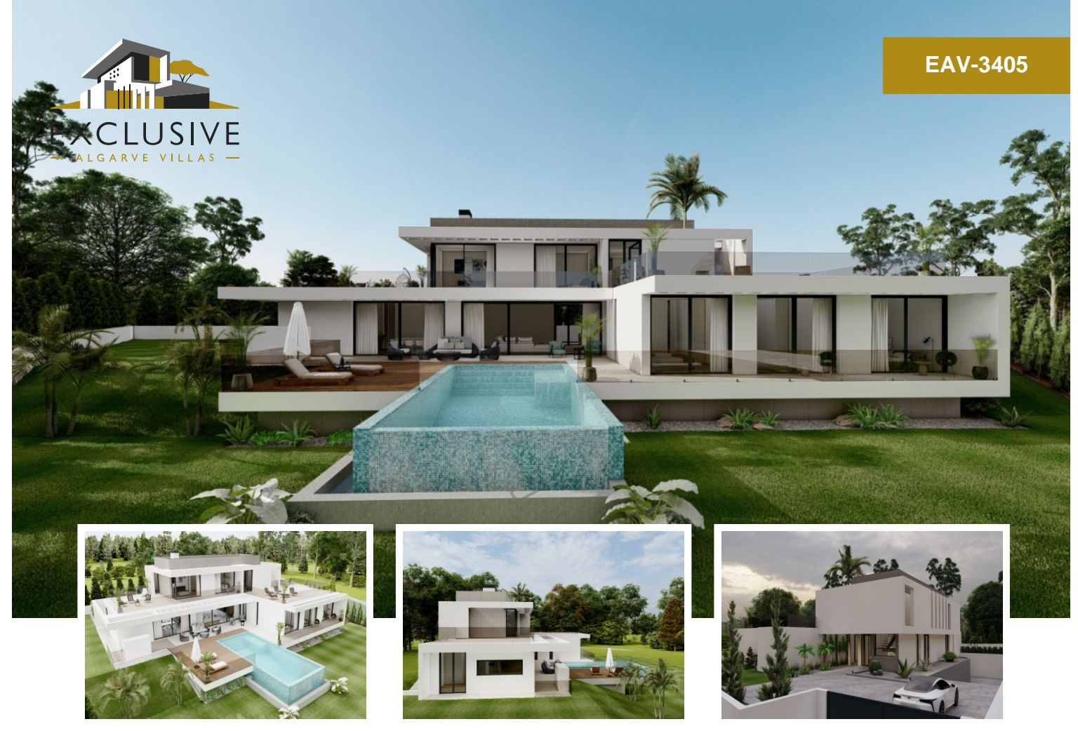
AMAZING CONTEMPORARY VILLA WITH POOL FOR SALE IN CARVOEIRO, ALGARVE