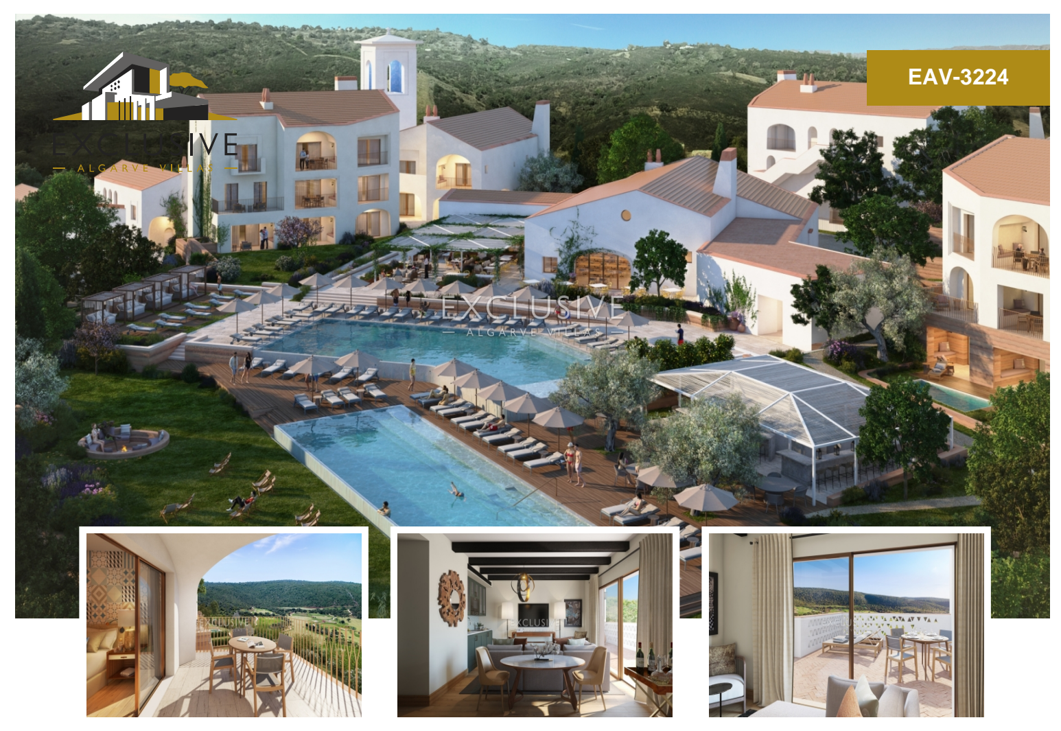
LUXURY SERVICED GOLF APARTMENTS FOR SALE CENTRAL ALGARVE